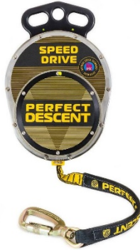
Perfect Descent Model 230S