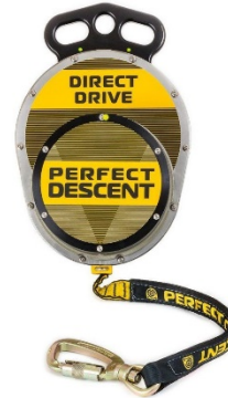
Perfect Descent Model 230D